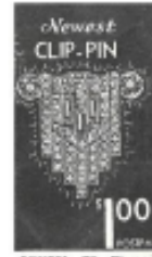
20W321—Clip Pins are the rage in Paris—wear them on your shoulder, your hat, or where you will. These lacquered shaped brooches and two large full set stones in a background of sparkling white rhinestones. Postpaid, $1.00