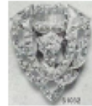
A "whitestone" dress clip from the Chas. L. Trout 1931 catalog

Read the full article on the MAFCA Website at http://www.mafca.com/ef_articles.html and learn how dress clips were used in daily fashion during the Model A years!