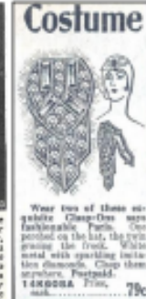
Wear two of these on white. They are very fashionable. Postpaid, $1.00. 14K908A Pins, each, 75c.

Montgomery Ward & C. Sears, Roebuck & Co. Spring/Summer 1931