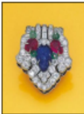
A Cartier Clip Brooch circa 1928.