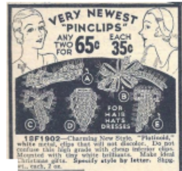
Sears, Roebucks, and Co. Fall/Winter Catalog 1931-32. "Any Two for 65c."