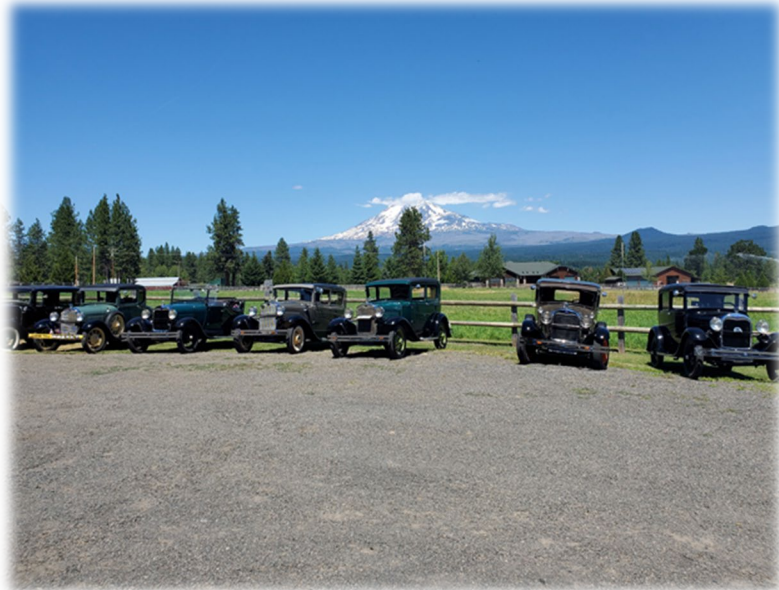
Model A's parked at Studebaker Bob's for a photo shoot with Mt Adams in the background.

There will be no August Meeting or Annual Potluck Picnic.