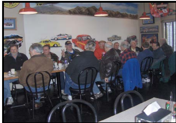
Wednesday Breakfast Meeting at Bennie's