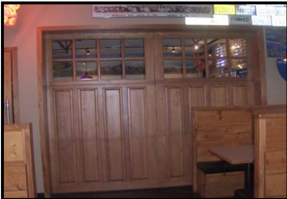
Breakfast Meeting Behind Closed Doors