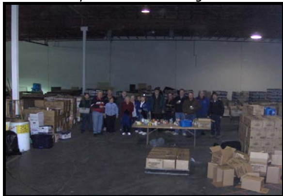
Group done for the day!