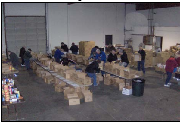
Club members sorting food for FISH