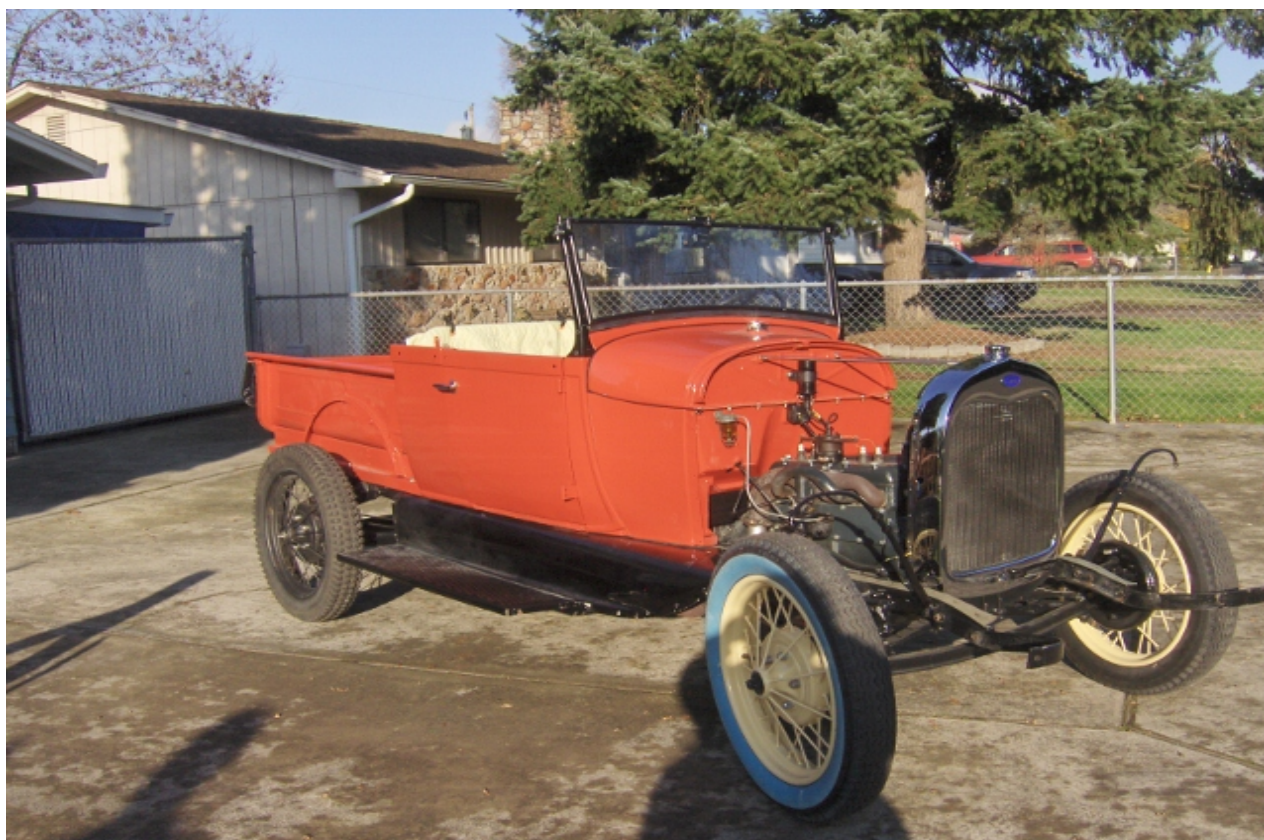
1929 Sportster Pickup