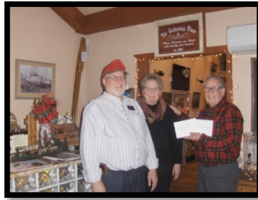
Mr. & Mrs. Model A