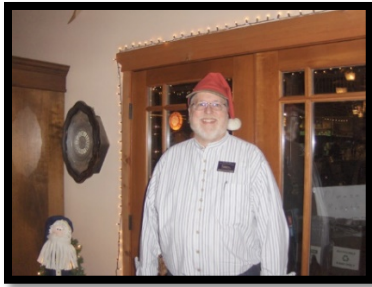
Member of the Year