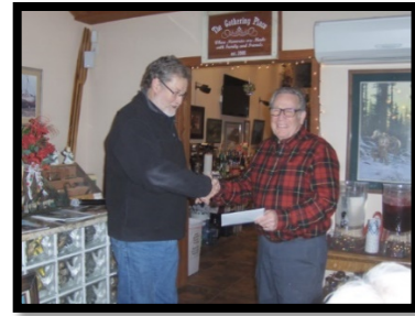
Hard Luck Award