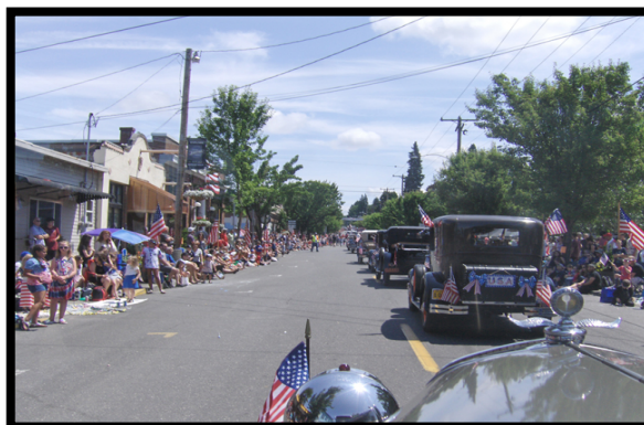
Photo from the Ridgefield Parade 2019